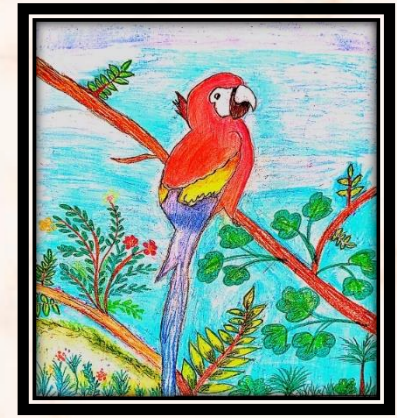
AKSHITA MIRE (III)