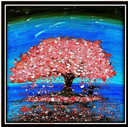
VANSHIKA AGRAWAL (VI)